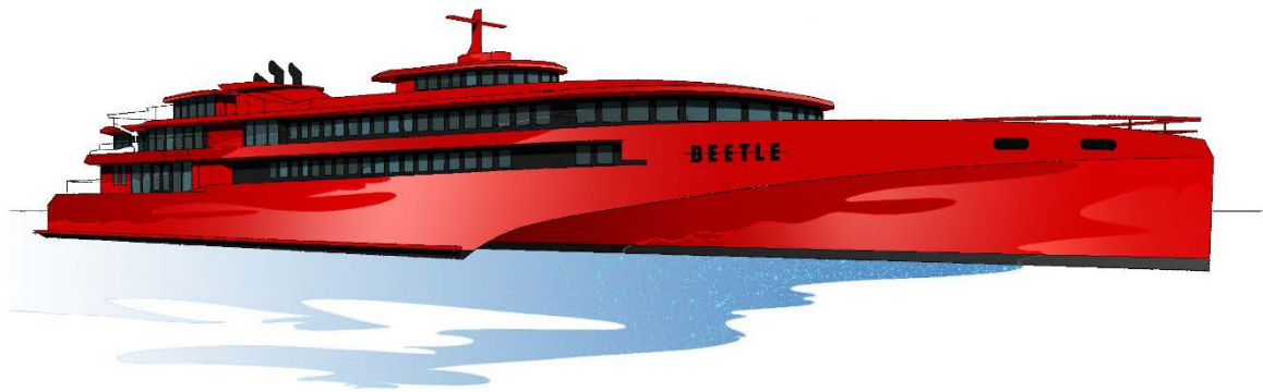
Above: Artist impression of the 83 metre trimaran high speed passenger ferry to be designed and constructed for JR Kyushu Jet Ferry.