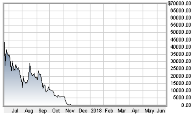
■ DELCATH SYS INC as of 6/21/2018