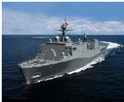
HII's Ingalls Shipbuilding division has received a $165.5 million contract to provide long-lead-time material and advance construction activities for LPD 30, the first Flight II LPD.

Huntington Ingalls Industries is America's largest military shipbuilding company and a provider of professional services to partners in government and industry. For more than a century, HII's Newport News and Ingalls shipbuilding divisions in Virginia and Mississippi have built more ships in more ship classes than any other U.S. naval shipbuilder. HII's Technical Solutions division provides a wide range of professional services through its Fleet Support, Integrated Missions Solutions, Nuclear and Environmental, and Oil and Gas operations. Headquartered in Newport News, Virginia, HII employs more than 39,000 people operating both domestically and internationally. For more information, visit www.huntingtoningalls.com