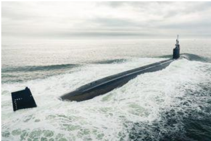
Indiana (SSN 789) pictured during sea trials in May.