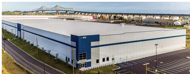
ePort 960 and 1000 – Perth Amboy, NJ Full building leases with 4PX Express (354,250 SF) and Metropolitan Warehouse and Delivery (220,200 SF), bringing recently acquired 3.4 million-square-foot portfolio to 100% occupancy