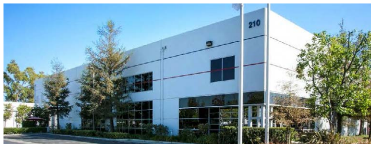
210 West Baywood Avenue – Orange, CA 56,095-square-foot industrial building; 100% leased