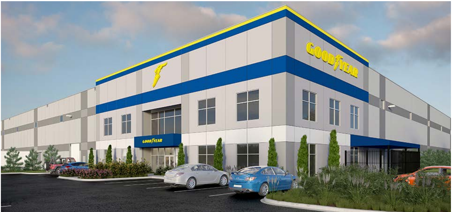
RGLP Intermodal 9789, Columbus, OH — 1,204,580-square-foot, build-to-suit logistics center for Goodyear