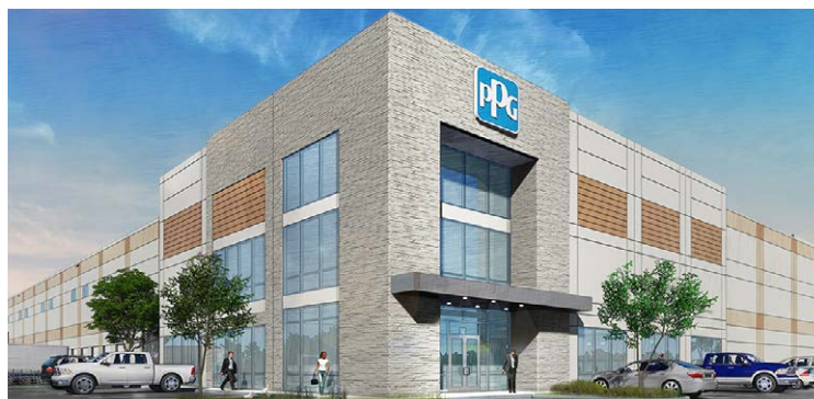
Lakeside Ranch 1001 – Flower Mound, TX 634,564-square-foot spec building; 71% preleased by PPG