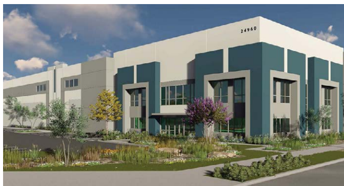
24960 San Michele – Moreno Valley, CA 244,336-square-foot spec industrial building; 100% preleased by ResMed, Inc.