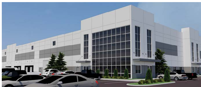
33 Logistics 1620 – Lehigh Valley, PA 1.0 million-square-foot lease with UPS