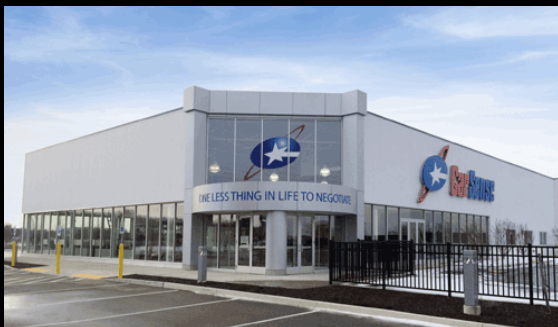
Robinson Twp., PA