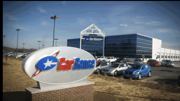
Cranberry Twp., PA