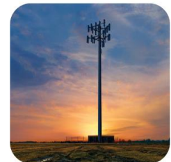
MOBILE PHONE SYSTEM 300 or more circuit breakers, sensors, & switches