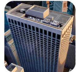
LARGE HVAC SYSTEM Dozens of sensors & switches