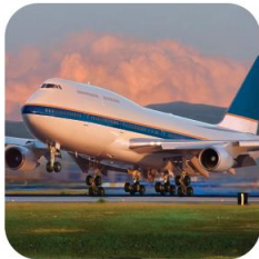
COMMERCIAL JET Up to 1,500 circuit breakers & switches