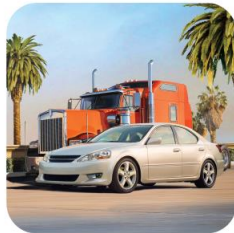
AUTOMOBILE Up to 50 sensors & controls