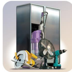
U.S. HOME 30 or more sensors, switches, & other safety devices