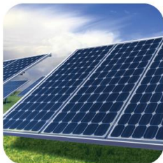
PHOTOVOLTAIC SYSTEM 1 to 4 high voltage switches & fuses