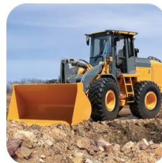
CONSTRUCTION VEHICLE 5 to 10 sensors, switches, & circuit breakers