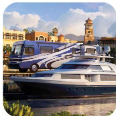
RV & LARGE BOAT Up to 60 power inverters, sensors, & protection devices