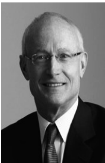
Michael E. Porter, Ph.D., age 66, Director of the Company since 2013

Committee Memberships: Strategy; Innovation (Chair)