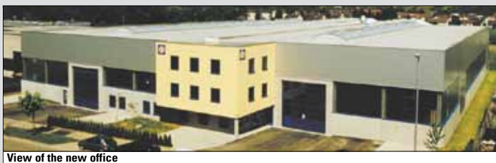
View of the new office

LORENZ | HURTH PFAUTER | KAPP KOEPPER | NILES LIEBHERR REISHAUER LINDNER KLINGELNBERG GLEASON VMMW